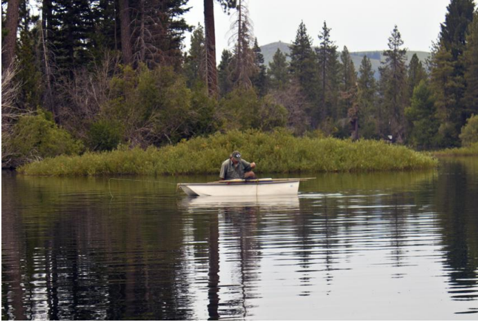
(Above L) Angler on Manzanita Lake