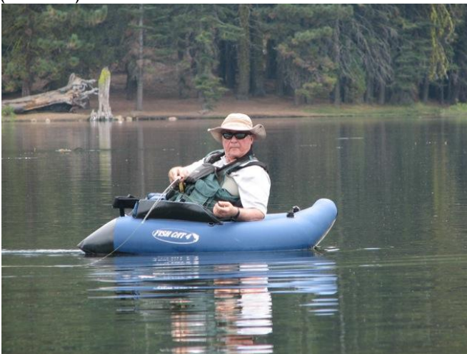
(Above L) Angler on Manzanita Lake