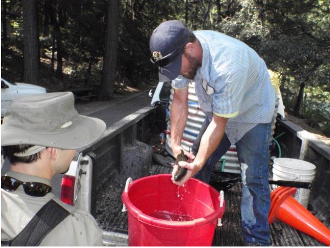
(Above L) Our request to fish in the hatchery truck barrel was denied!