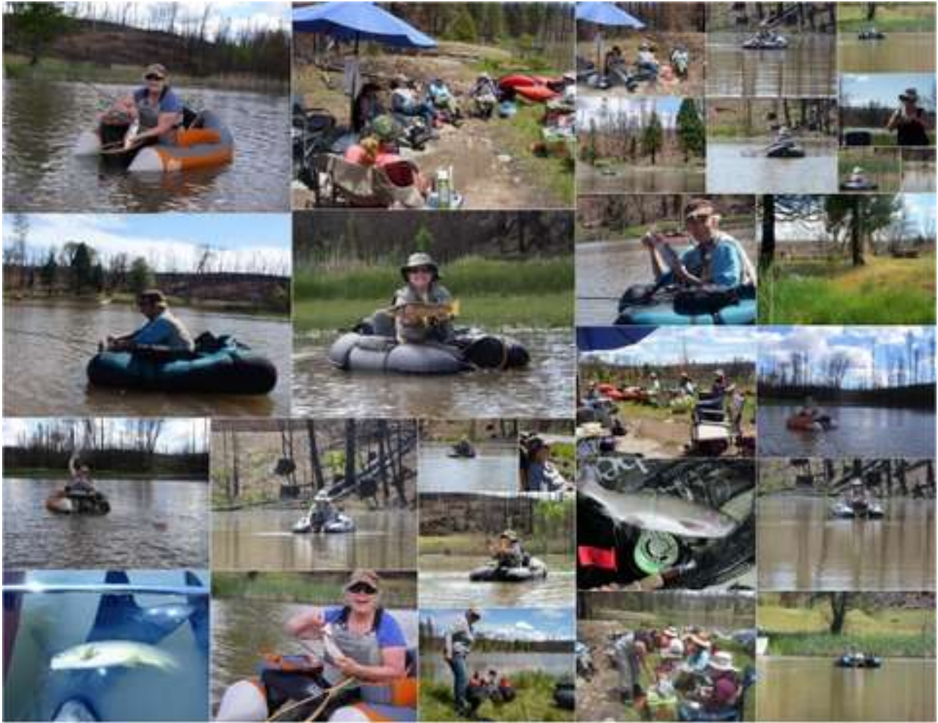
Photo Collage of the 2013 Lake Christine Mayflies Outing Fundraiser 5/18/2013