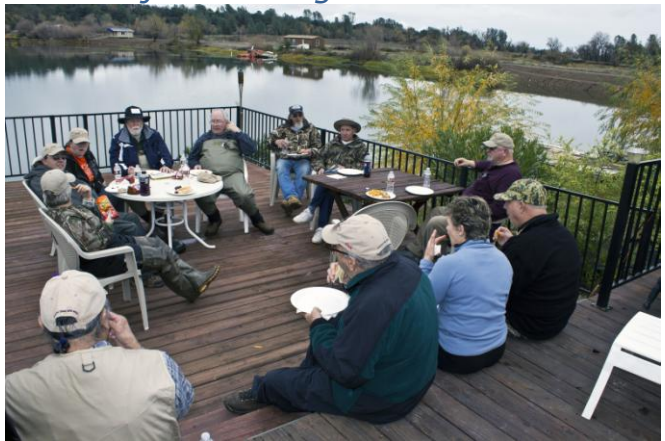
Project Healing Waters Fishout