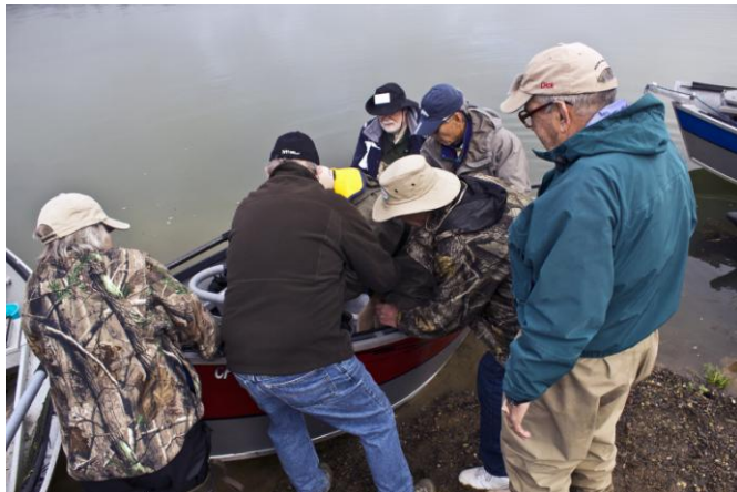
Project Healing Waters Fishout