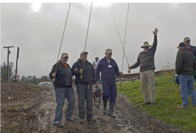
Project Healing Waters Fishout