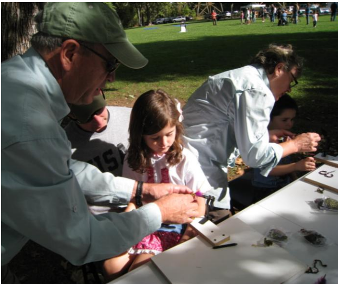
2012 Fly Fair - Kids Fly Tying