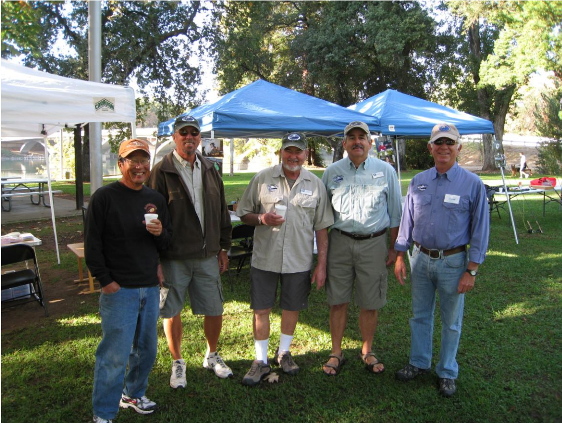
2012 Fly Fair Setting Up