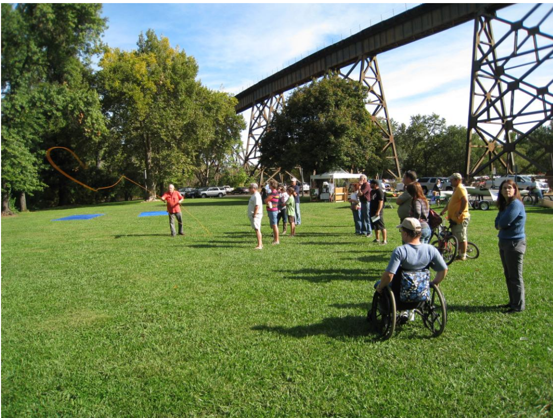
2012 Fly Fair Casting Lessons