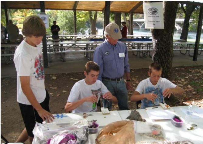
2012 Fly Fair - Kids Fly Tying