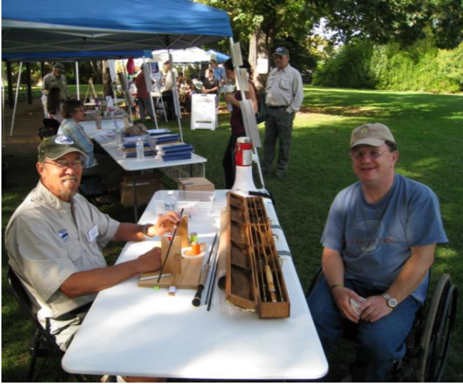
2012 Fly Fair Rod Building