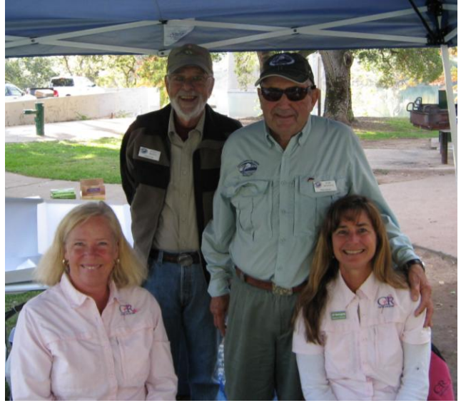
2012 Fly Fair - Casting for Recovery