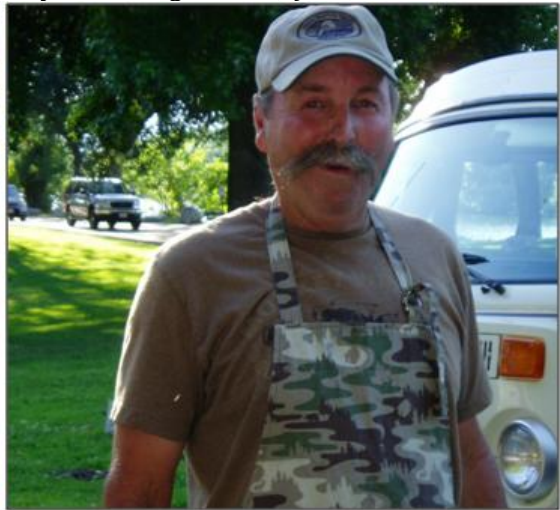
STFF Annual Barbeque Chef, 6/13/2012