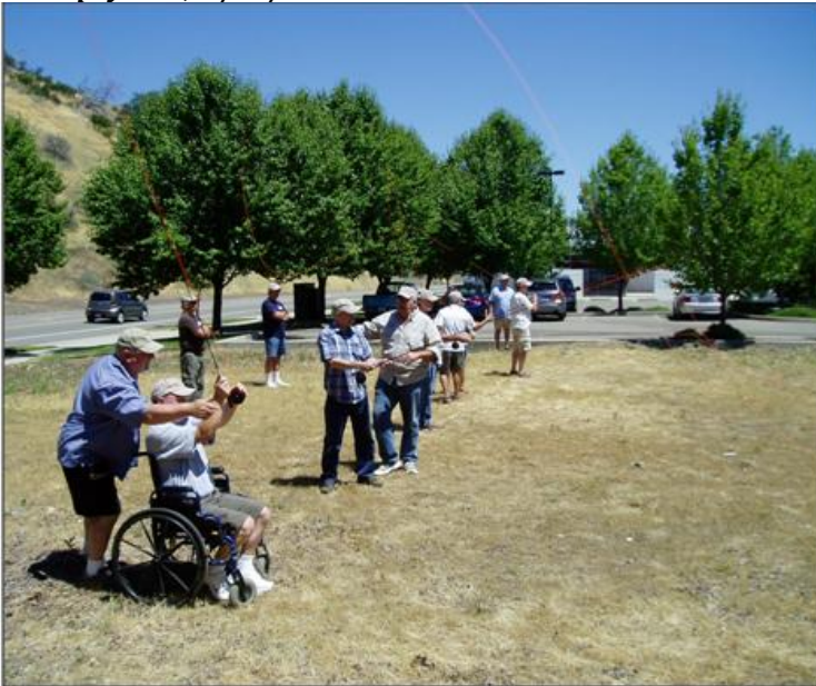
Project Healing Waters, June, 2012