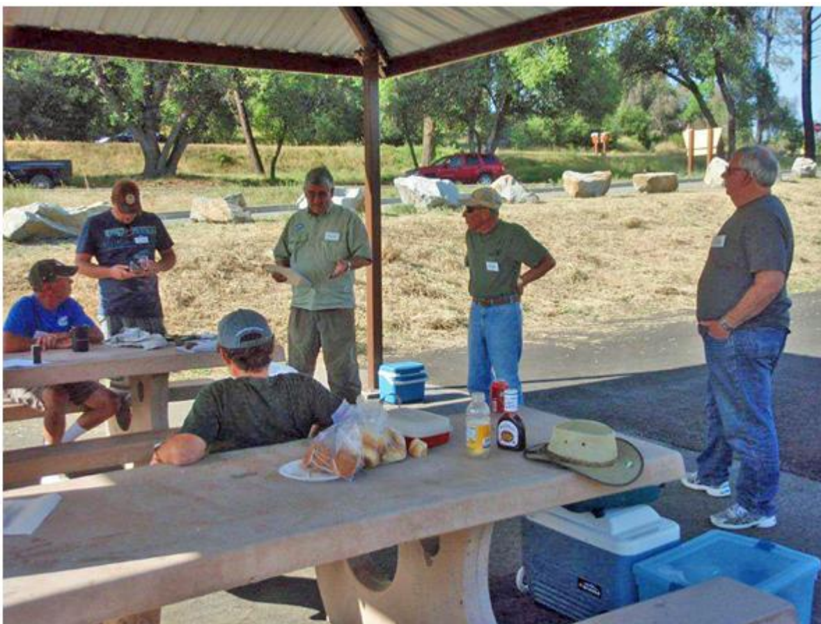
Clear Creek Evening Fishout, 5/15/2012