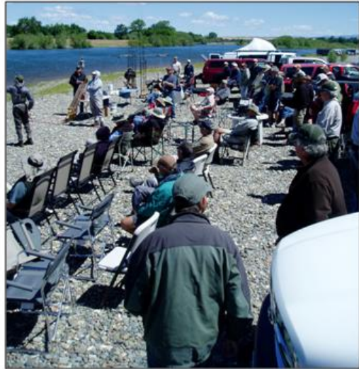
STFF Spey Fest, 6/09/2012