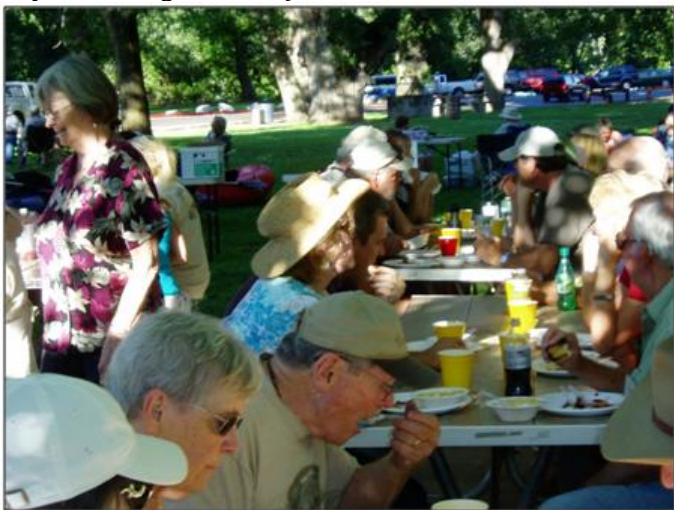
STFF Annual Barbeque, 6/13/2012