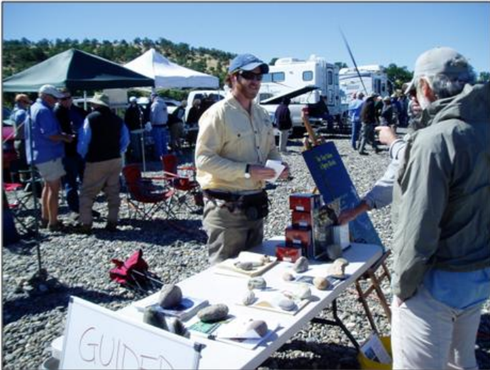
STFF Spey Fest, 6/09/2012