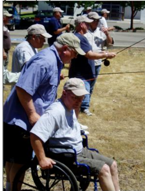
Project Healing Waters, June, 2012