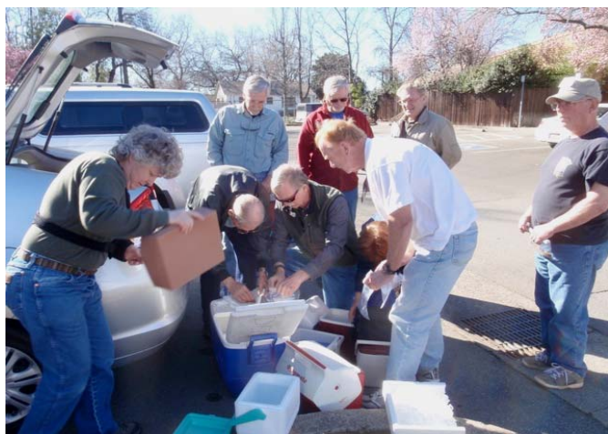
The eggs arrive at DFG headquarters and are made ready for delivery to the six schools.