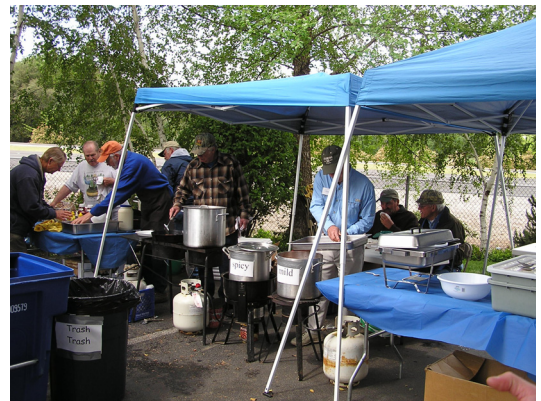
STFF members serve lunch at The Fly Shop's Opening Day party